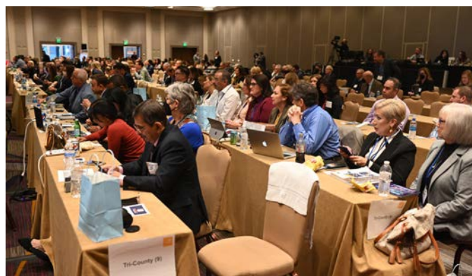
TCDS seated in our two rows at the general HOD meeting.