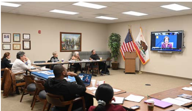
Pre-HOD meeting via Zoom at TCDS Board Room.