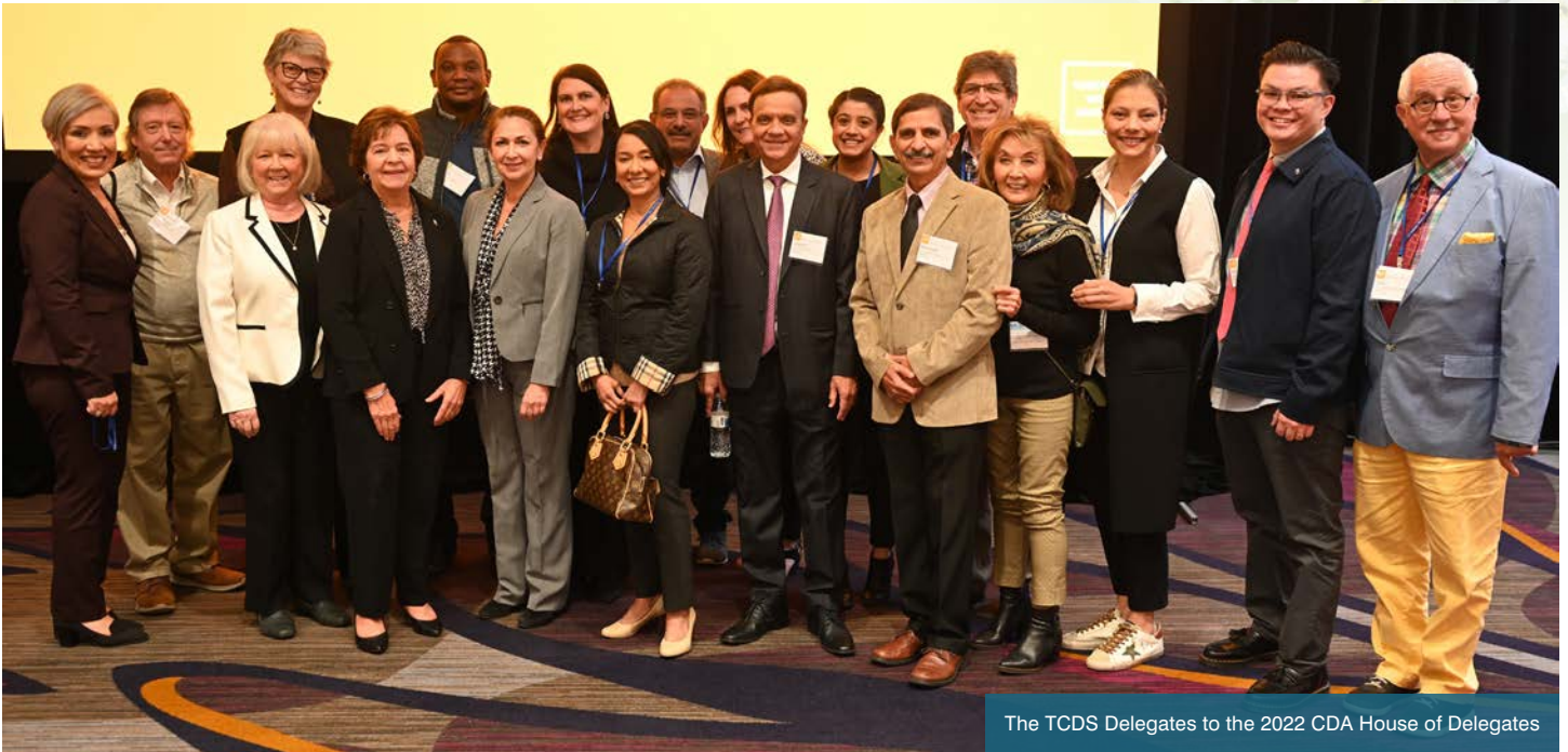
The TCDS Delegates to the 2022 CDA House of Delegates